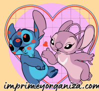
TABLA DEL 10

9x1=9 9x2=18 9x3=27 9x4=36 9x5=45 9x6=54 9x7=63 9x8=72 9x9=81 9x10=90