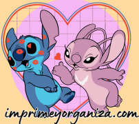
TABLA DEL 2

1x1=1 1x2=2 1x3=3 1x4=4 1x5=5 1x6=6 1x7=7 1x8=8 1x9=9 1x10=10