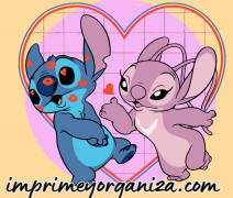
TABLA DEL 7

6x1=6 6x2=12 6x3=18 6x4=24 6x5=30 6x6=36 6x7=42 6x8=48 6x9=54 6x10=60