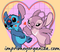
TABLA DEL 3

2x1=2 2x2=4 2x3=6 2x4=8 2x5=10 2x6=12 2x7=14 2x8=16 2x9=18 2x10=20