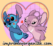
TABLA DEL 8

7x1=7 7x2=14 7x3=21 7x4=28 7x5=35 7x6=42 7x7=49 7x8=56 7x9=63 7x10=70