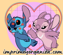
TABLA DEL 11

10x1=10 10x2=20 10x3=30 10x4=40 10x5=50 10x6=60 10x7=70 10x8=80 10x9=90 10x10=100