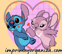
TABLA DEL 5

4x1=4 4x2=8 4x3=12 4x4=16 4x5=20 4x6=24 4x7=28 4x8=32 4x9=36 4x10=40