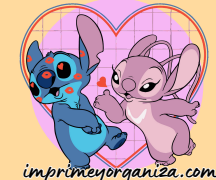
TABLA DEL 6

5x1=5 5x2=10 5x3=15 5x4=20 5x5=25 5x6=30 5x7=35 5x8=40 5x9=45 5x10=50