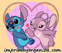
TABLA DEL 9

8x1=8 8x2=16 8x3=24 8x4=32 8x5=40 8x6=48 8x7=56 8x8=64 8x9=72 8x10=80